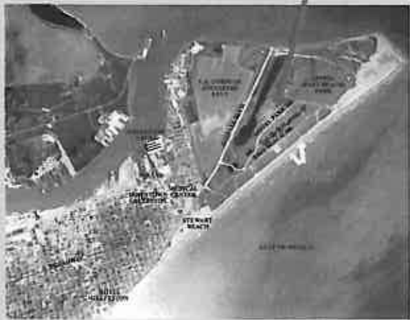
Location of Beachtown on the Galveston Coastline

This is great news for the future residents of Beachtown. They will be able to sleep comfortably knowing that not only will they be able to enjoy the beautiful beaches and homes in Beachtown, but also many future generations to come.