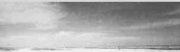
The beautiful vast beaches of Beachtown